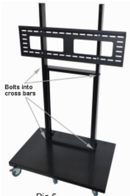
Bolts into cross bars

4. Attach the 2 x Cross Bars to the Uprights: Position each of the 2 black Cross Bars between the uprights, lining up the end holes with the holes in the Uprights (see Pic 5). Put a long (50mm) bolt & washer through the upright into the Cross Bar & tighten. Complete all 4 bolts.